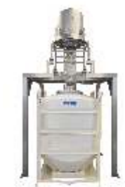
Sack Tip & Sieve