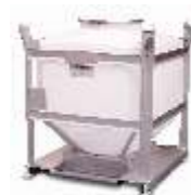
R Series IBC