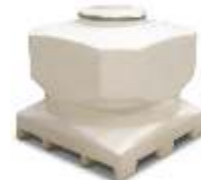
H Series IBC

This information and data is provided for illustrative purposes only and does not form part of any contract or agreement. The information and data may be updated and changed from time to time.