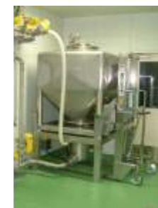
IBC Wash Station