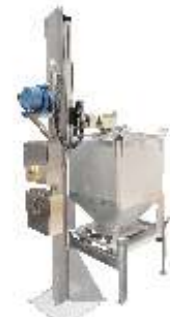
IBC Wash Station