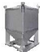
S Series IBC