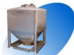
Intermediate Bulk Containers (IBCs)