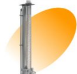
GTC (Gentle Transfer Chute)