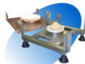
IBC Discharge Stations