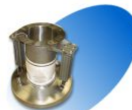
IBC Filling Systems