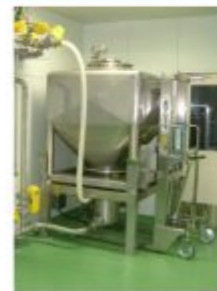
IBC Wash Station