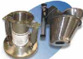
IBC Filling Systems