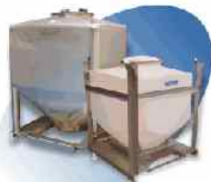
Intermediate Bulk Containers (IBCs)