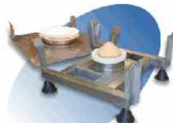
IBC Discharge Stations