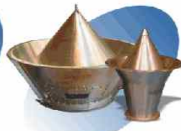
Silo / hopper Discharger Valves