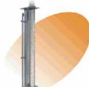
Gentle Transfer Chute (GTC)