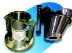
IBC Filling Systems