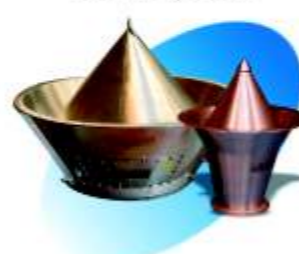
Silo / hopper Discharger Valves