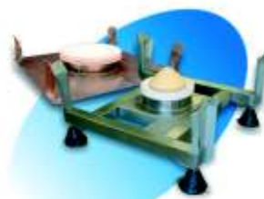
IBC Discharge Stations