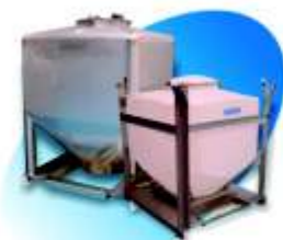
Intermediate Bulk Containers (IBCs)