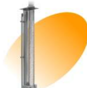
Gentle Transfer Chute (GTC)