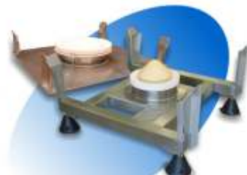
IBC Discharge Stations