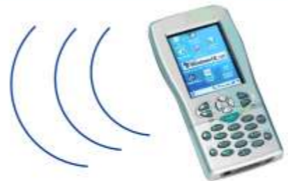
Handheld RF PC Scanner