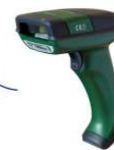
RF Barcode Reader