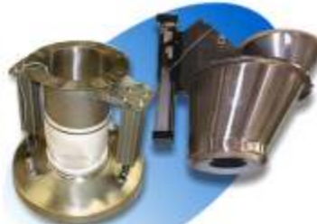
IBC Filling Systems