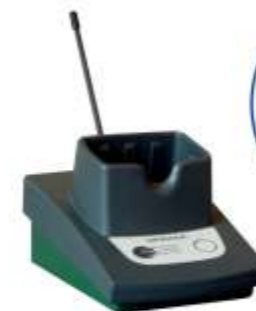
RF Base Station