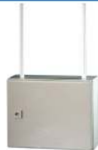
RF Access Point