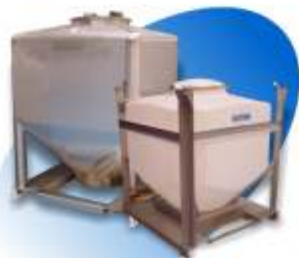
Intermediate Bulk Containers (IBCs)