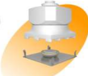
Bulk Tablet IBC and Tablet Discharge Stations