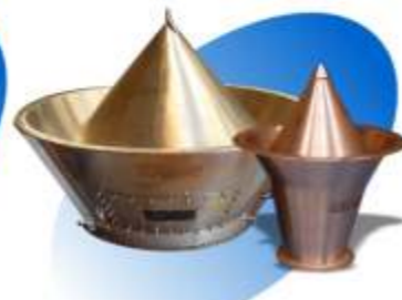
Silo / hopper Discharger Valves