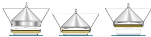
1. Before Capping 2. Cone leveled and Capped 3. IBC removed