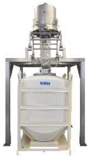
Sack Tip & Sieve