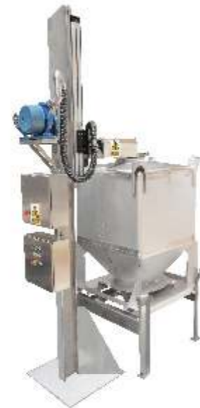
IBC Wash Station