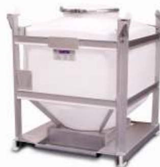
R Series IBC