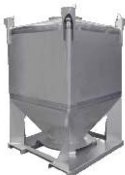
S Series IBC