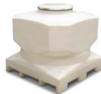
H Series IBC